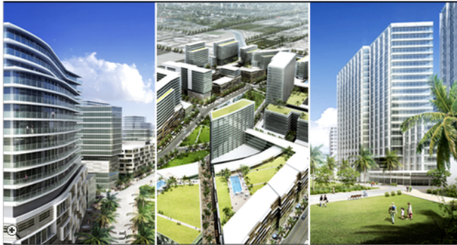
[Potential renderings via Boston Global Investors]

It's been quite a while since we heard anything about Warner Center's enormous, 47-acre ex-Rocketdyne site, but now all of a sudden there's enormous news: it's set to become a $3-billion, eco-friendly, transit-oriented, high-rise community . (No word yet on how many stories those high-rises might be.) Seems like those efforts toward a more "cosmopolitan" Warner Center are in full swing (Streetsblog's "Manhattanization" is probably more accurate). The new development will add more than five million square feet to the Center: 3.95 million of that will be residential, but the development will also have lots of public space, a 155,000-square-foot hotel, and an assisted living development, adding up to what developers hope will be a "24/7, transit-oriented location," reports the Daily News .